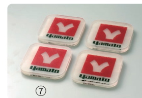
⑦ Seismic mat