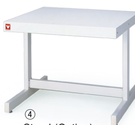
④ Stand (Option) ONS60