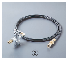
Water Supply Unit (OWH10)