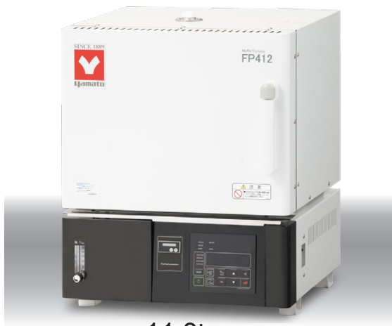
11.3L FP412 Flowmeter (option)