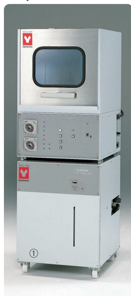
Combination with water purifier