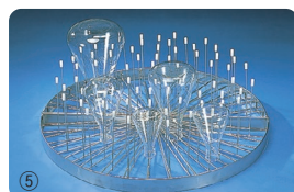
Flask rack (glasswares not included)